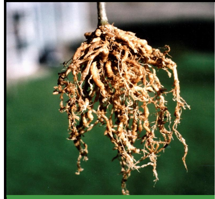
Root knot nematodes NEMATODE - ( Meloidogyne incognita )