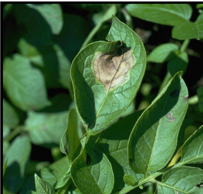
Late blight FUNGUS – ( Phytophthora infestans )