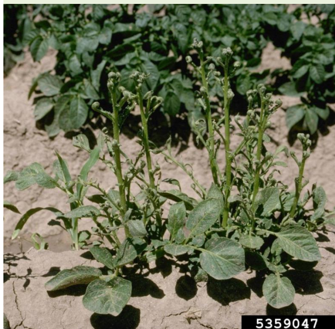
Herbicide damage HERBICIDE – (Clopyralid)