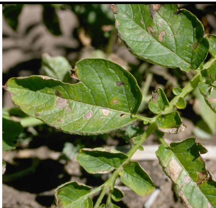
Early blight FUNGUS – ( Alternaria solani )