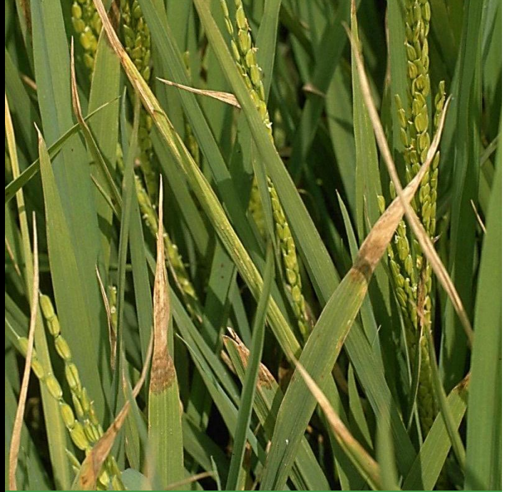
Leaf scald FUNGUS – ( Microdochium oryzae )