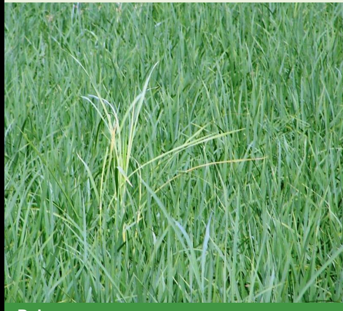
Bakanae FUNGUS – ( Fusarium fujikuroi )