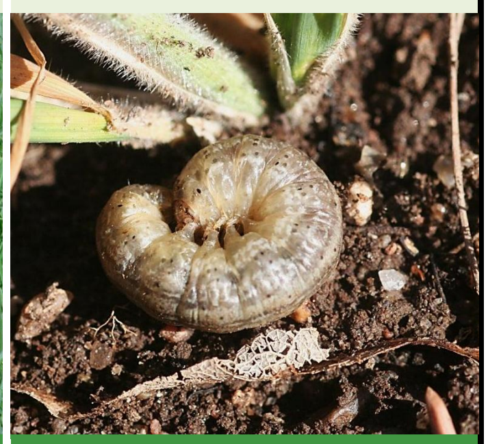
Army cut worm INSECT – (Spodoptera litura)