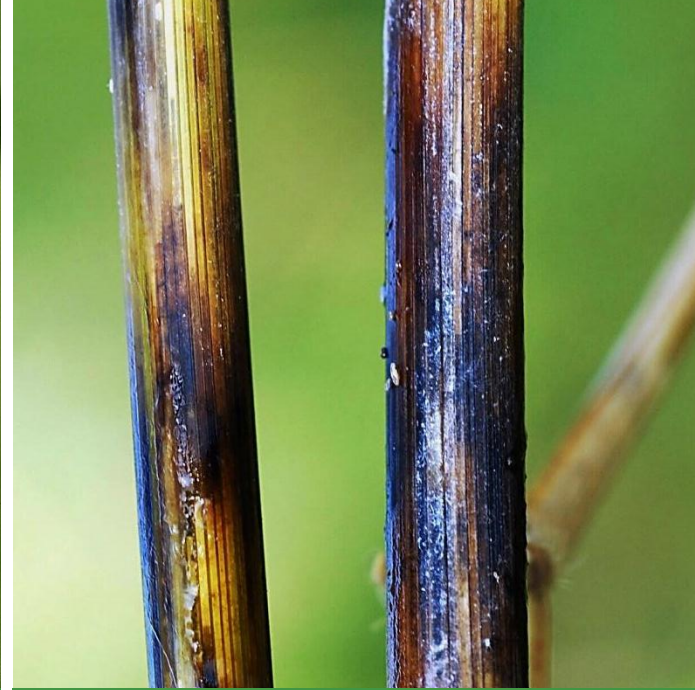
Stem rot FUNGUS – ( Sclerotium oryzae )