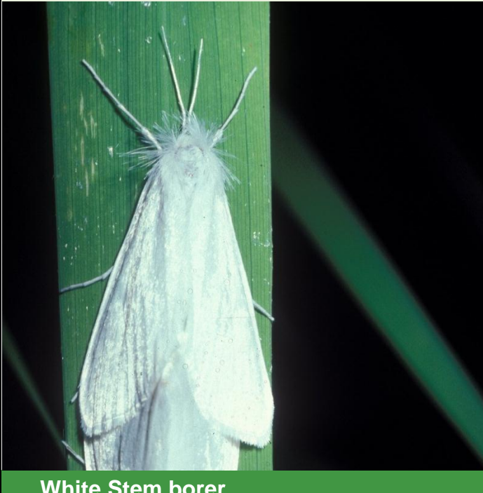
White Stem borer INSECT – (Scirpophaga innotata)