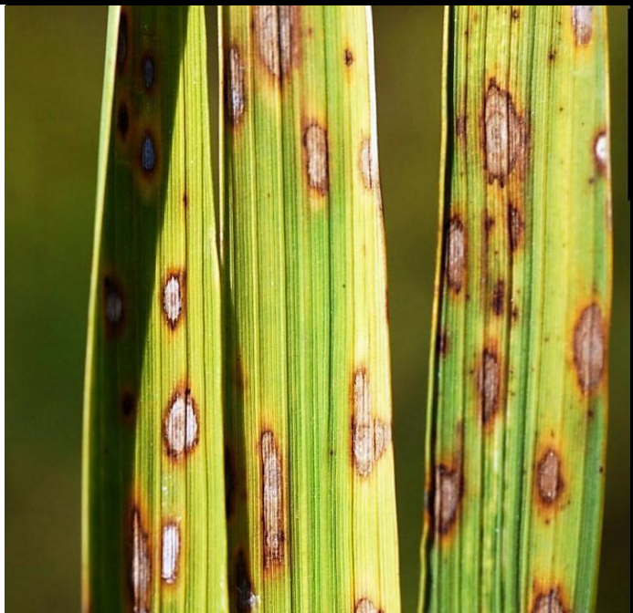
Brown spot FUNGUS - ( Bipolaris miyabanus )